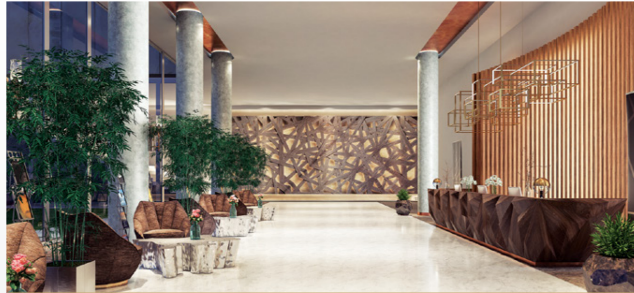
GRAND LOUNGE AREA