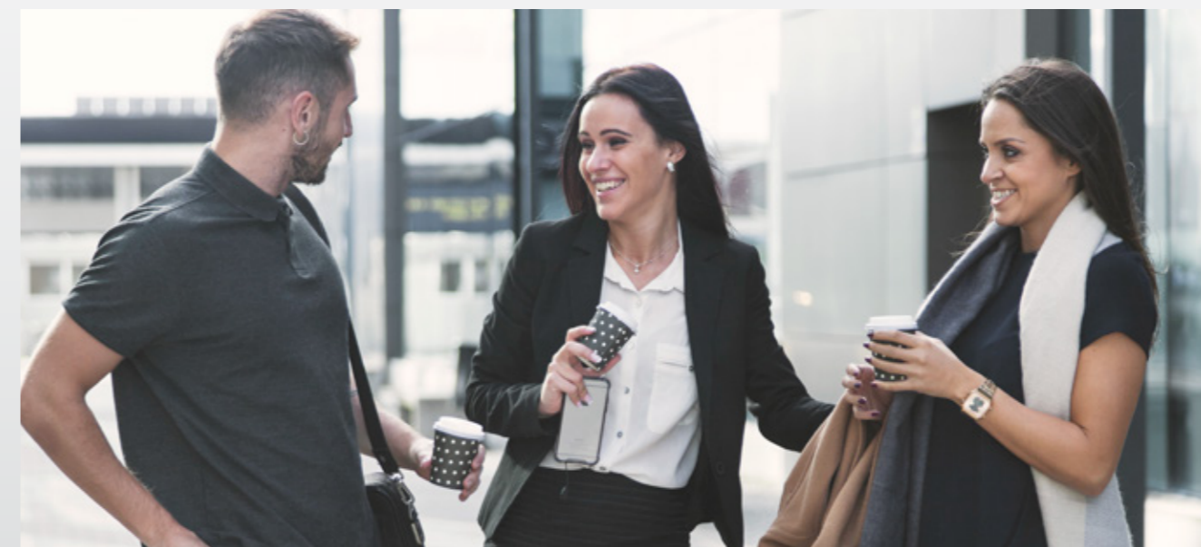
MODERN AND LIVELY ENVIRONMENT