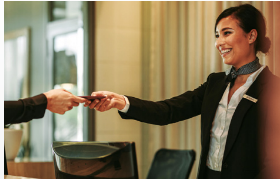
TOP-OF-THE-LINE CONCIERGE SERVICES