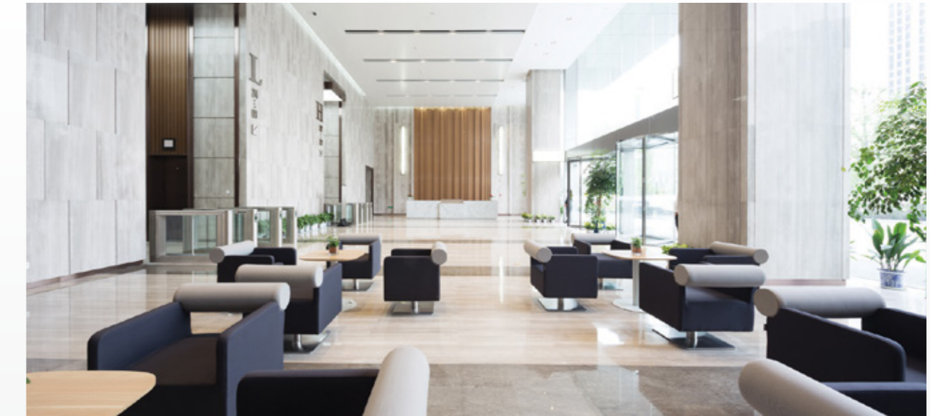
SPREAD ACROSS ABOUT 1800 SQ. M.