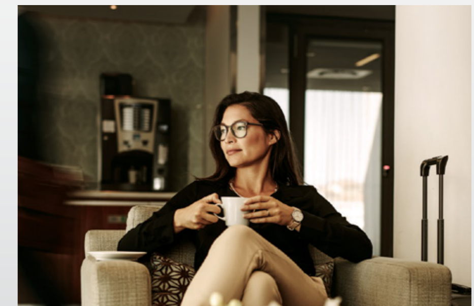
UNIVERSAL ACCESS MEMBERSHIP CARD