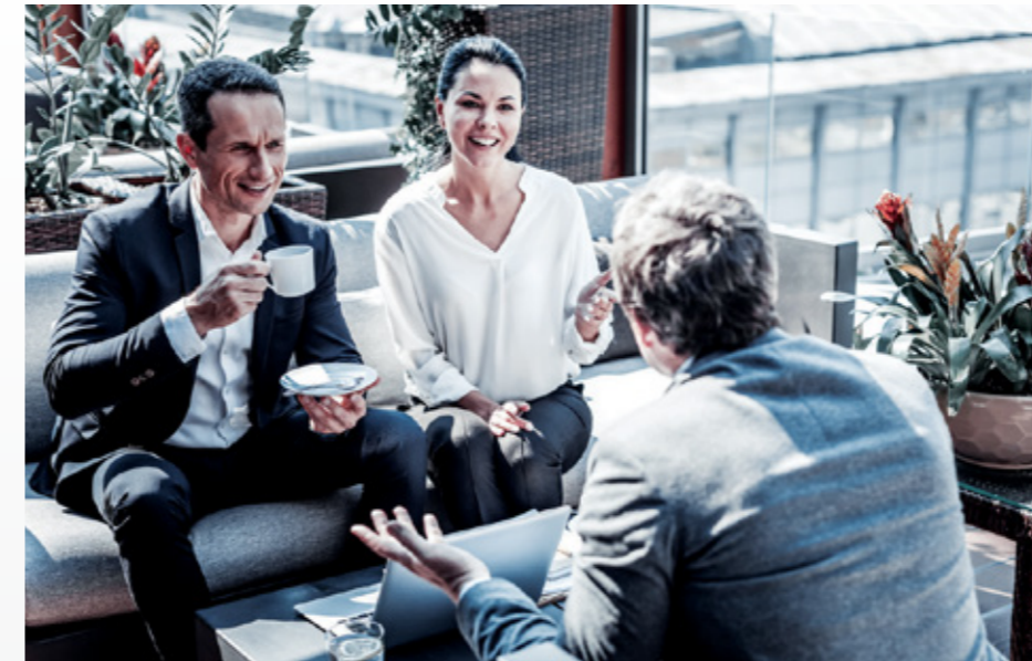
EXCLUSIVE CLUBHOUSE FOR LEISUR NETWORKING AND GROWTH