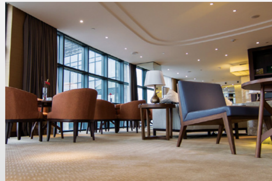
EXCLUSIVE PRIVATE LOUNGES