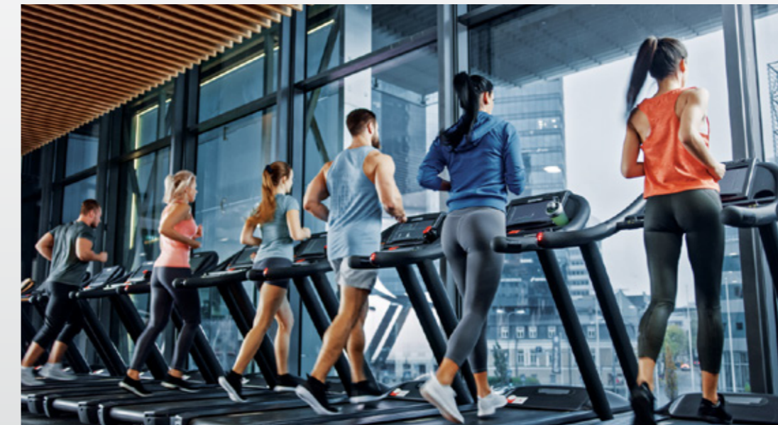
STATE-OF-THE-ART GYMNASIUM, YOGA AND PILATES STUDIO